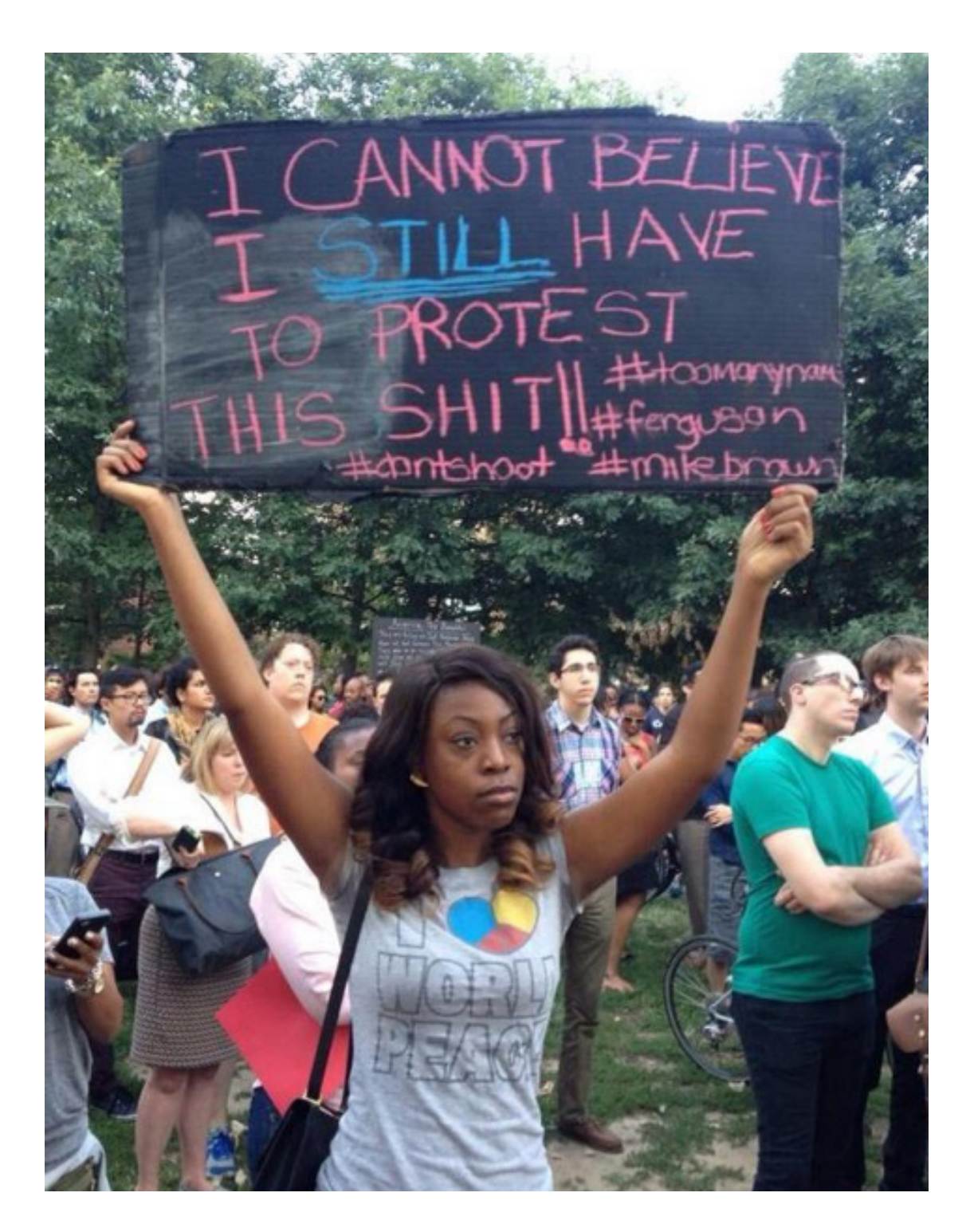
Figure 5: 'I Cannot Believe I STILL have to Protest this Shit' Sign, with Hashtags. (Starr, 2014).

The tension between this neoliberal desire to reduce hashtag publics to product publicity, and the activist desire to use hashtags to further public sphere awareness of political issues is codified in the controversy over the 'algorithmic filtering' (Tufekci, 2014) of #Ferguson on Facebook. When many began to notice that #Ferguson was trending on