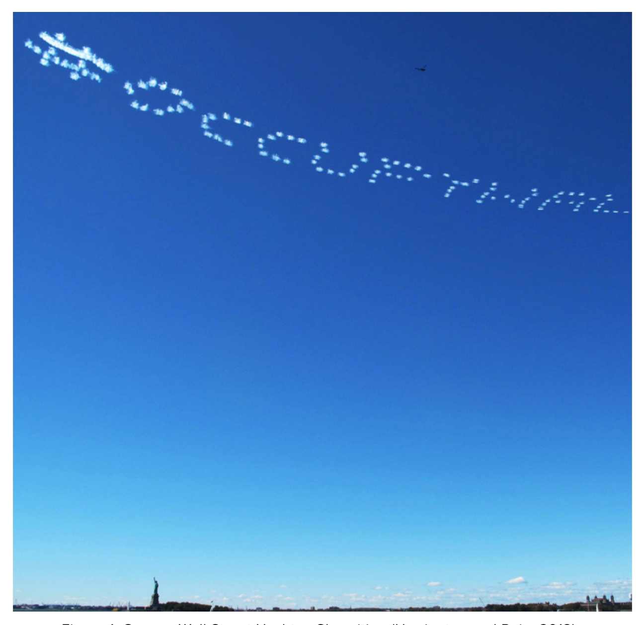
Figure 1: Occupy Wall Street Hashtag Skywriting (Harrington and Rojo, 2012)

text actually described. When I ask my students what they think 'global village' means, I usually get an answer that is akin to some cosmopolitan utopia, a borderless community where geographic distance no longer holds the same meaning and everyone is happy and connected. Then I get them to take apart the actual text. McLuhan deploys the 'tribal village' as a problematically racist metaphor, where the sound of war drums—heard by all in such a small space—gets everyone excited or angry. His argument that 'electronic interdependence recreates the world in the image of a global village' (1962: 31) has nothing to do with utopia. He envisioned a world where everyone is connected through these flows of information in ways that yes, draw us together, but he saw that drawing-together as fraught, complicated, even dangerous. We all hear the drums, no matter where we are;