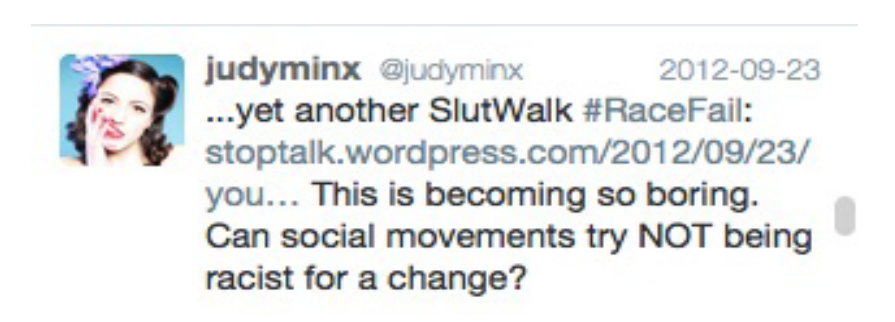
Figure 2: #RaceFail Tweet about issues of Racism Surrounding the Toronto SlutWalk 2012

well as outing one prominent critic by exposing her LiveJournal pseudonym, collectively collapsing the textual world of critique with that of interpersonal and professional politics (Somerville, 2013).