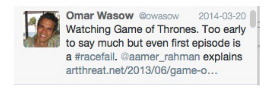
Figure 3: #RaceFail Tweet Linking to Article about Racism in Game of Thrones

Collected around these loose main structuring events in the blogosphere is a nimbus of related discourse. The Topsy timeline indicates that while there were discussions of race in science-fiction and fantasy before this epoch-making epic web brawl, the emotions and issues thrown up in this scuffle were truly an 'incitement to discourse' in Foucault's (1976: 17) sense, with the keyword and then hashtag RaceFail—not present in web archives before this point—crystallising the affect of these debates into a diachronic anchor point that allows the thread to be pulled together across space and time. It is interesting, in particular, how this tagging had the ability to pull even-earlier material into its ambit. For example, this paper's snowball strategy retrieved many texts that that don't actually contain the term 'RaceFail', such as Bear's original post; however, by subsequent diachronic linking and archiving, and synchronic blog posts and comment threads, the hashtag collects and self-organises the material most relevant to it, linking back to incorporate even material that came before it, and helped it become.